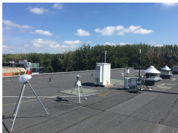
Real-time bioaerosol monitor in Osijek

The project RealForAll modernized public health service and notably enhanced the quality and applicative value of the information they provide in cross-border area: by introducing real time monitoring of airborne allergens, by developing models for prediction exposure and by creating a joint platform for instantaneous dissemination of these information. In addition, the project made an effort to educate end users on the benefits of using information for prevention and management of allergy symptoms based on the information public health services will provide following the implementation of this project. Two real-time airborne pollen monitors enabling real-time measurement of airborne aerobiological particles (i.e. pollen, fungal spores), were purchased including all necessary parts for continuous outdoor monitoring of airborne pollen.