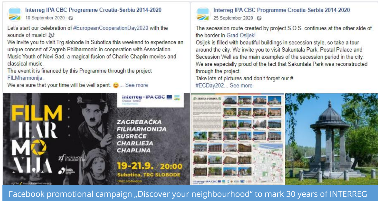
Facebook promotional campaign „Discover your neighbourhood“ to mark 30 years of INTERREG

Project XBIT, which was contracted under 1 st Call for Proposals, was nominated as one of 25 finalists of the 2020 RegioStars competition for the best EU cohesion policy projects in 5 categories. Project XBIT was in the category “Empowering young people for cross-border cooperation” and competed with 4 more projects from Europe for the votes of the audience and the jury award, but in the end was not the winner for this category.