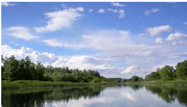
River Bosut, Croatia

EcoWet project contributed to the protection and sustainable use of wetland ecosystems in the Danube floodplain of the Croatia – Serbia cross-border region. Main outputs of the project were Guidelines on ecosystems mapping and assessment tested on pilot areas in the cross-border area, educational events and the ecosystem processors for wastewater purification. EcoWet researched wetland areas of the Croatian and Serbian border regions, including river Bosut, Kopački rit, Spačva and Zasavica.