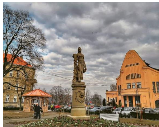
Revitalized Osijek's Sakuntala Park

The S.O.S. project addressed the legacy of Osijek's and Subotica's secession period. The main objective of the project was to valorise and revitalize the joint cultural heritage shared by the cities of Osijek and Subotica. The project developed a new tourism product by creating thematic routes based on secession architecture, developed plan for the reconstruction of Subotica City Hall and revitalized Osijek's Sakuntala park, a well-known secession park dating from the 19 th century.