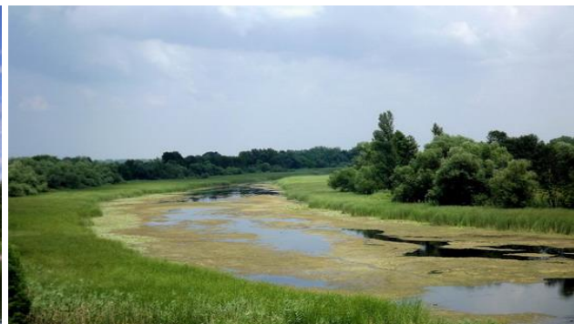
River Zasavica, Serbia