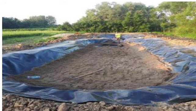
Ecosystem processor in Zasavica, Serbia

The project ORGANIC BRIDGE improved competences of organic producers in Osijek-Baranja County and South and North Bačka District by providing trainings and counseling services through established competence centers. More than 200 organic producers and potential organic producers were trained and/or used counseling services on the topics of organic production control and certification, additional processing in organic production, innovation in production, marketing etc. By establishing a cross border network of organic producers the region's organic production potential is interconnected and increased.