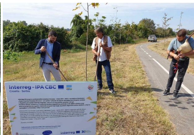
Planting 15 trees in Zasavica (Serbia)

European Cooperation Day was also promoted through the social media campaign “Discover your neighbourhood” on Facebook. During 4 weeks campaign, interesting touristic routes, sites and events, developed or improved within projects were presented on Programme’s Facebook page and followers were invited to visit or (re) discover them and share their experience by posting their photos and using the dedicated hashtags. Among others, the campaign promoted a concert organized by project FILMharmonija, a secession route in Subotica and Osijek by the project S.O.S. and nature routes by the projects HORIS and VISITUS.