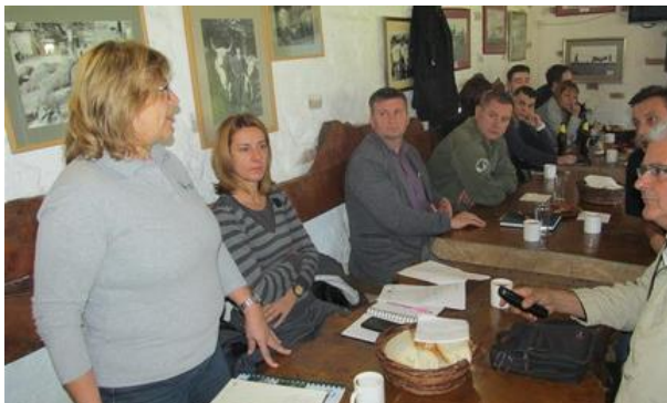
Stakeholders training in Zasavica, Serbia

Ecosystems services in pilot areas were assessed based on developed methodology: biodiversity, wild goods, cultural goods, flood protection, climate regulation, nature based recreation and tourism, cultural services. Stakeholders, in particular protected areas managers, sectoral agencies and CSOs, were trained to use the methodology for ES mapping, assessment and action planning. Two constructed wetlands take advantages of main wetland ecosystem service – water purification – to purify waste water and polluted river water.