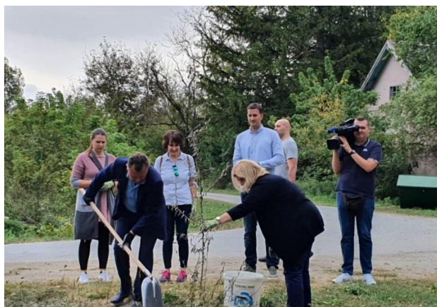
Planting 15 trees in Čarna (Croatia)

In order to mark the 30 years of INTERREG, the Programme organized 2 local events and planted 15 trees in each country (in Sremska Mitrovica in Serbia on 23 September 2020 and in Zlatna Greda in Croatia on 25 September 2020). 30 trees represent 30 years of successful INTERREG cooperation and one of the themes of the celebration (Green Europe).